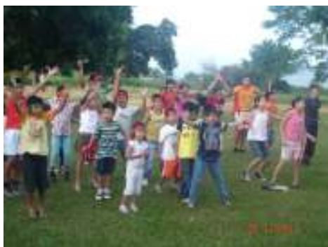
Games and more...

BUT THE LORD SAID TO ME, "DO NOT SAY, 'I AM ONLY A CHILD.' YOU MUST GO TO EVERYONE I SEND YOU TO AND SAY WHATEVER I COMMAND YOU. JEREMIAS 1:7